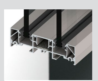
Double glazed sill shown above.