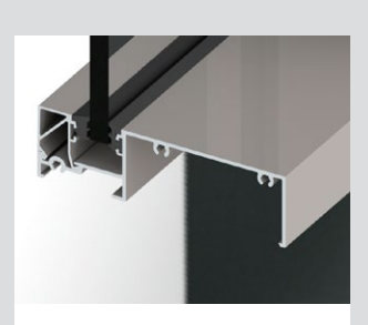
Single glazed sill shown above.