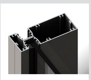
Single glazed mullion option for traditional partitioning applications.

Double glazed mullion will accept two monolithic sheets of glass up to 12.50mm thick. This creates approximately 44mm gap between for improved acoustic performance.